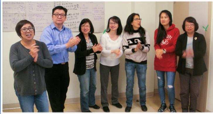
The EFT Rap in Chinese

At a recent EFT Externship for the Chinese community in Toronto (taught in both Cantonese and Mandarin) participants watched two live sessions. One couple taught participants about using EFT with an extremely shut down husband. The other featured a couple with trauma: trauma within the relationship and trauma in each partner's family of origin. Participants were moved by EFT's power to heal and transform deep shame.