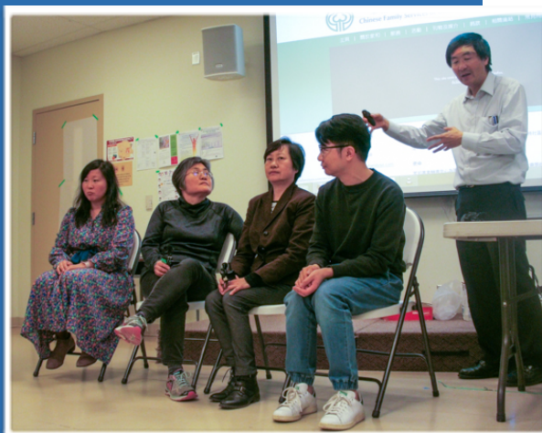
Panel on the challenges and joys of learning EFT

Trainings in Chinese Mandarin and Cantonese