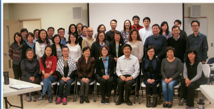
EFT Externship participants

At a recent EFT Externship for the Chinese community in Toronto (taught in both Cantonese and Mandarin) participants watched two live sessions. One couple taught participants about using EFT with an extremely shut down husband. The other featured a couple with trauma: trauma within the relationship and trauma in each partner's family of origin. Participants were moved by EFT's power to heal and transform deep shame.